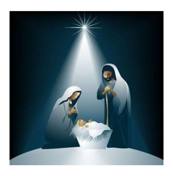
from the Church Staff